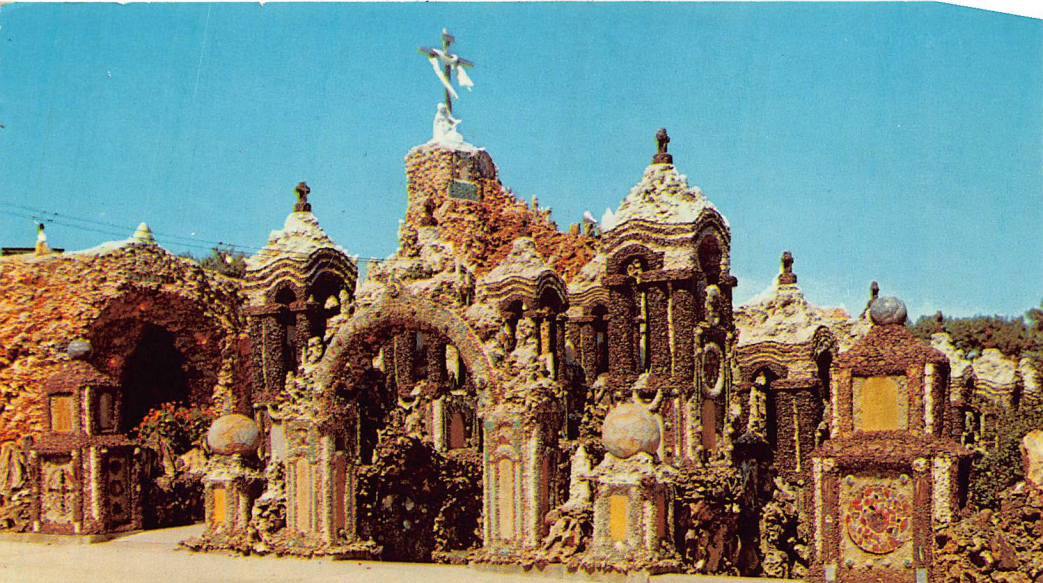
The Grotto of the Redemption