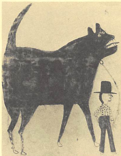
Man and Large Dog by Bill Traylor

Non-Profit Org. U.S. Postage PAID Permit No. 1 So. Orange, N.J.