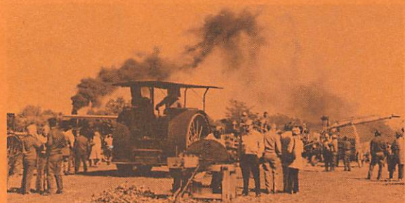
Threshing with steam engines at Horse Farming Days.