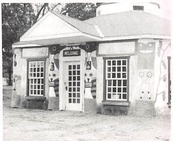
THE FIDDLE HOUSE

The "Fiddle House" museum/gift shop is open by appointment and on a daily basis during the peak tourism season. Souvenirs are also on sale at locations in Claremore. Call (918) 342-9149 for current information.