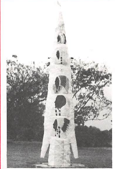
Totem picturing chiefs of the five civilized tribes.

The Rogers County Historical Society, the Kansas Grass Roots Art Association and the Foyil Heritage Association are working together in preservation of the Totem Pole Park.