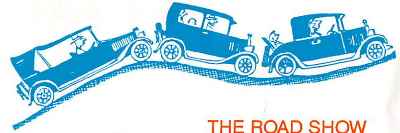
THE ROAD SHOW

Tours are given during the week by appointment for more information, call 552-1767