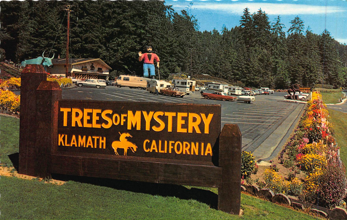
The Sign of Welcome